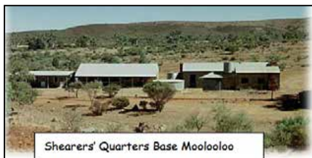
Shearers' Quarters Base Moolooloo

The number of insightful and astute questions which followed indicated a high level of interest in the approach taken by the foundation.