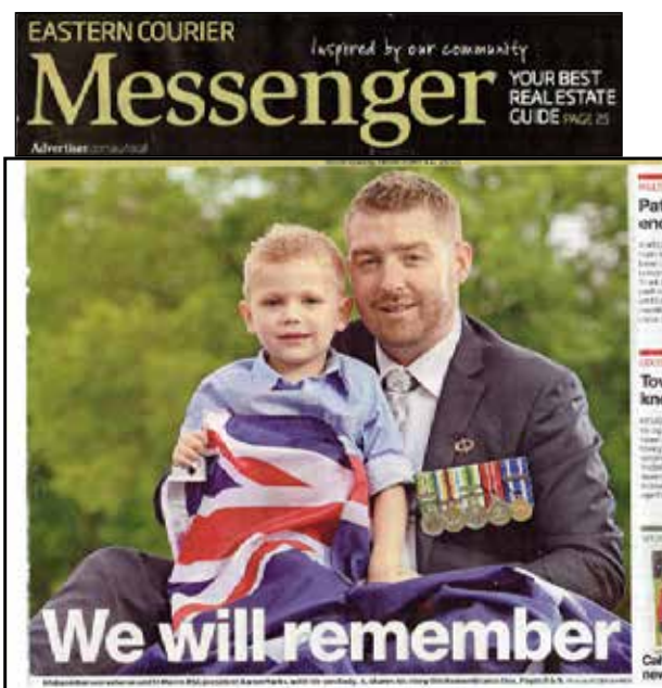
Eastern Courier Messenger.