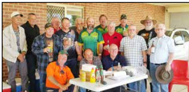
Transport Platoon post Vietnam era.

Essentially a free day with the options of company reunions or going to the 3 RAR SA Christmas Party.