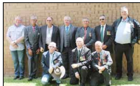
7 Platoon C Company 1977 era .