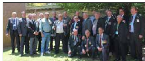
C Company post Vietnam era.

In summary it was a good reunion from which battalion associations can learn from its good points.