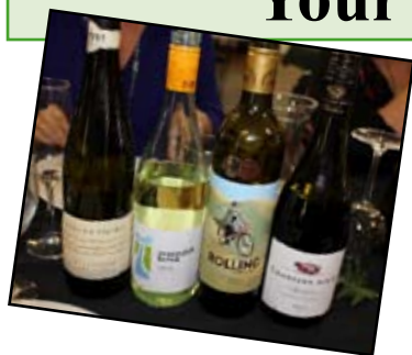
Yet another excellent selection