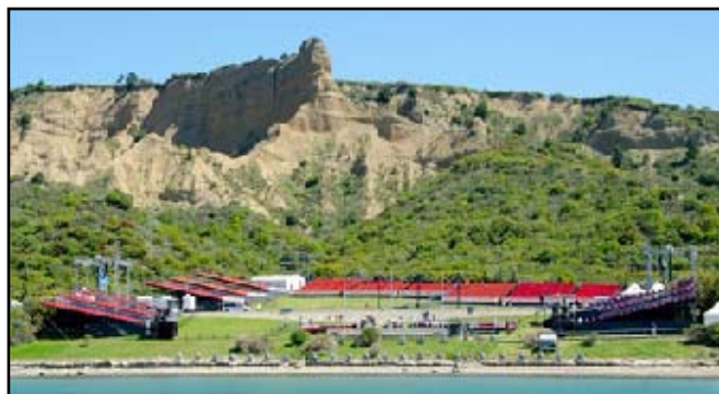
View of the site where the Dawn Service is held.

Australia and New Zealand run three commemorative services at Gallipoli on Anzac Day every year. The dawn service is followed by an Australian memorial service at Lone Pine, and a New Zealand service at Chunuk Bair.