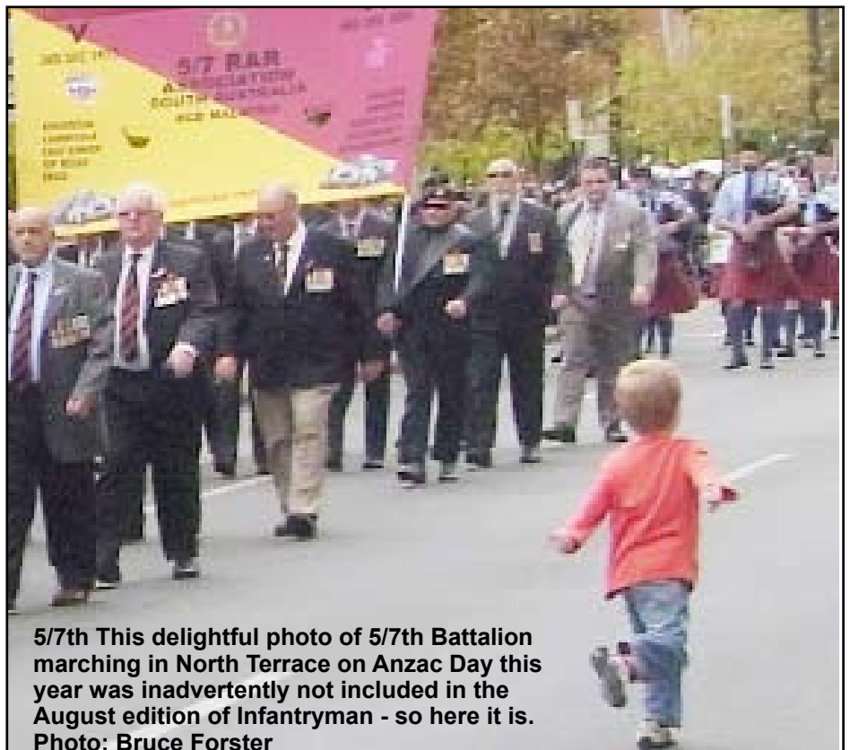
5/7th This delightful photo of 5/7th Battalion marching in North Terrace on Anzac Day this year was inadvertently not included in the August edition of Infantryman - so here it is.